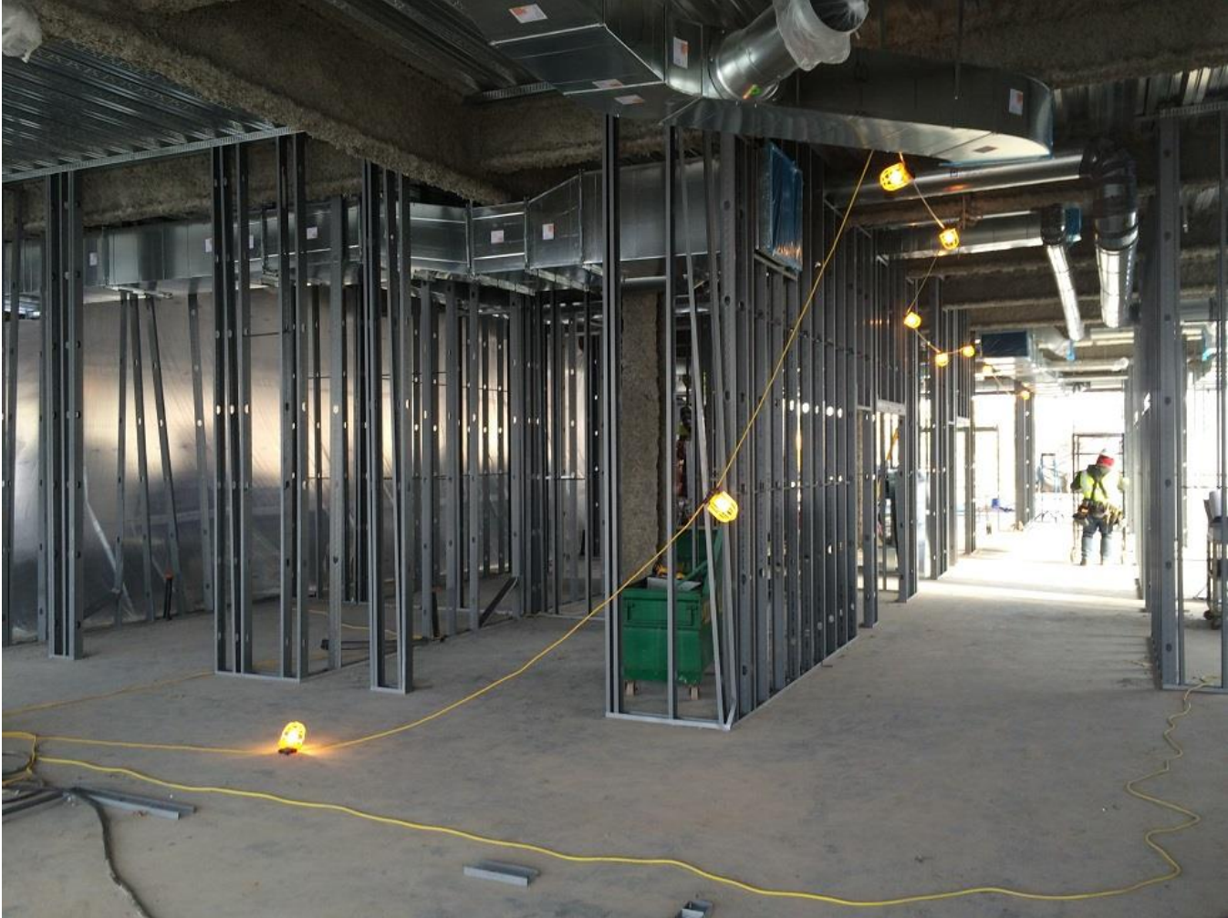
Steel Stud framing second level Seq 1