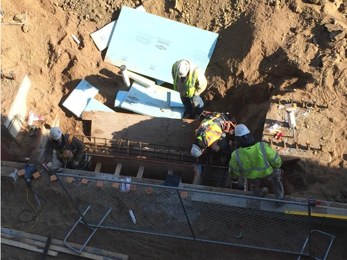
Setting up stoop on front side of building.