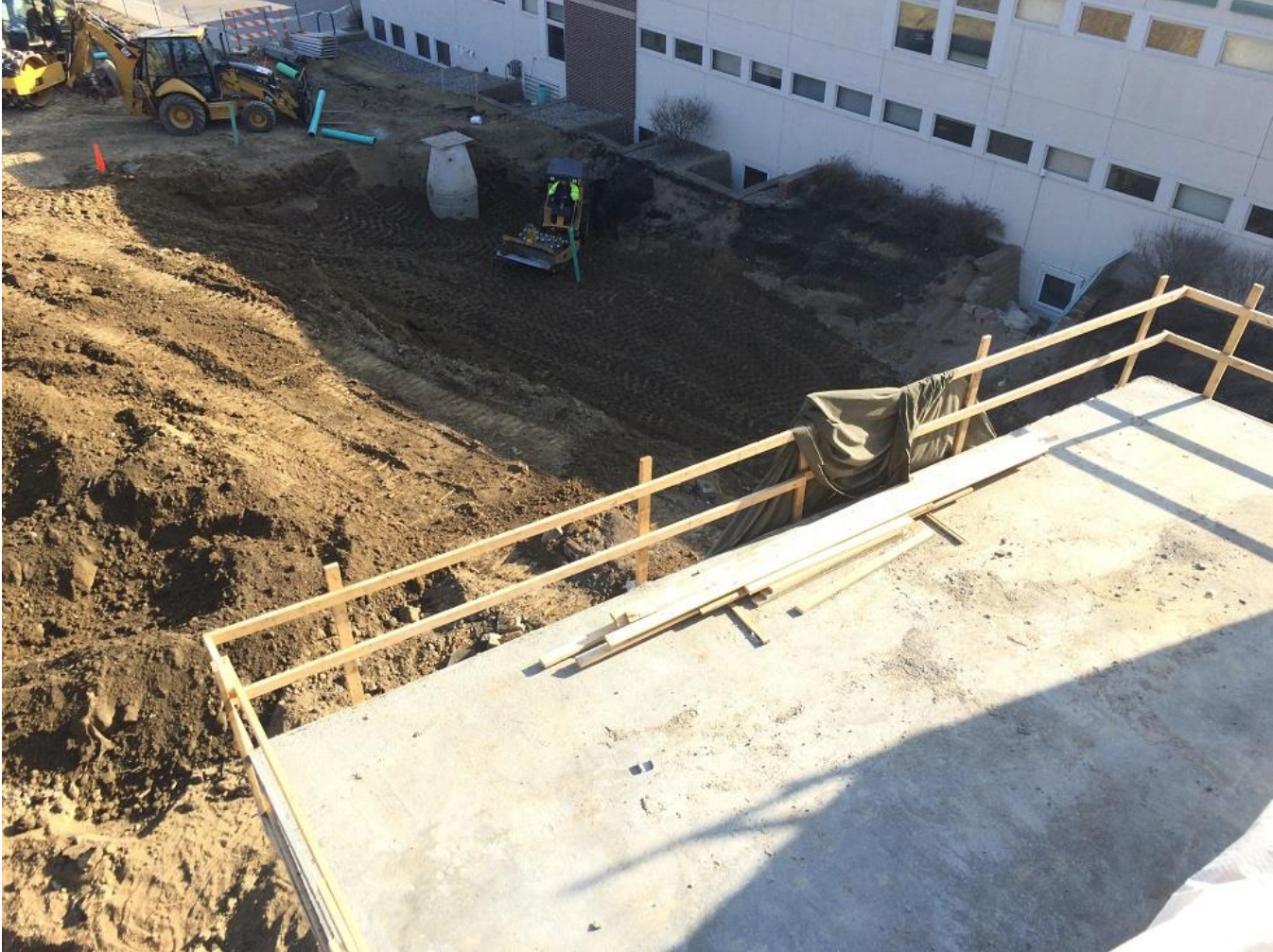
Back Filling site utilities on North Side of building